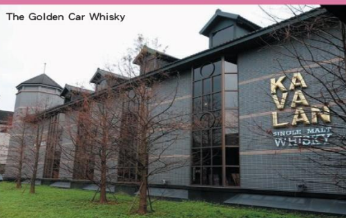
The Golden Car Whisky