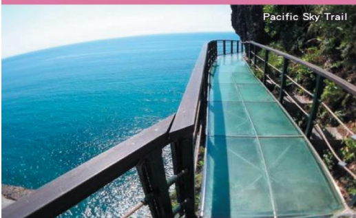
Pacific Sky Trail

SHOPPING STOP : Traditional Aboriginal Product, Tianlu Art Center, Pearl, Tea.